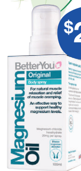
BetterYou Magnesium Oil Original Body Spray 100mL