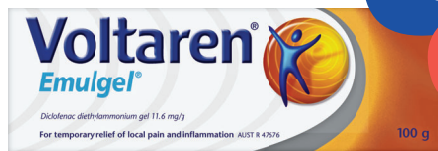
Voltaren Emulgel 100g