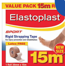
Elastoplast Sport Rigid Strapping Tape 15m