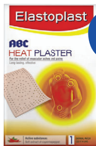
Elastoplast ABC Heat Plaster 1 Patch