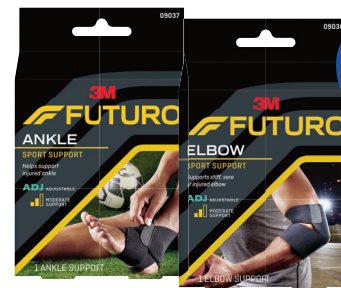
Futuro Sport Support Ankle or Elbow 1 Support