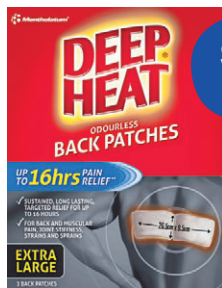
Deep Heat Back Patches Extra Large 2 Patches

Always read the label. Follow the directions for use.